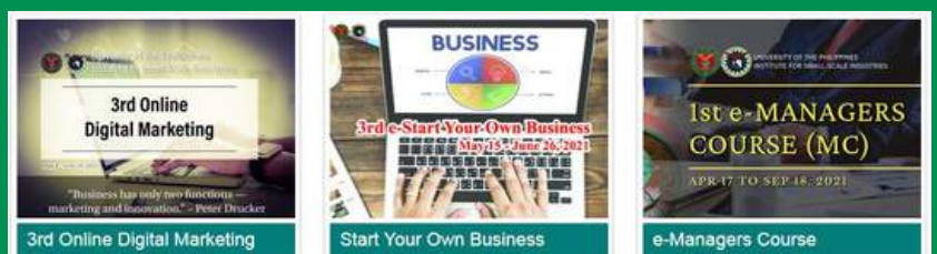
Previous and on-going e-Courses