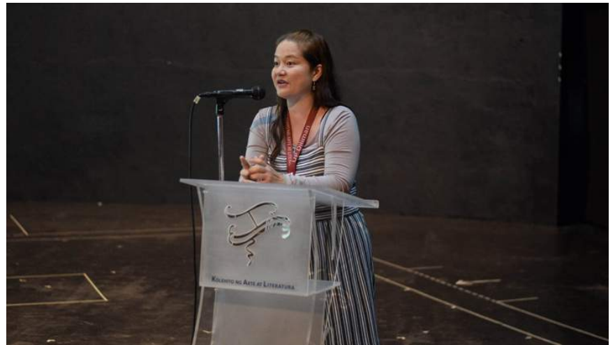
(August 2019)