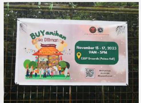
BUYANIHAN PART 3

UP ISSI Celebrates Anniversary with bazaar, learning, mentoring sessions