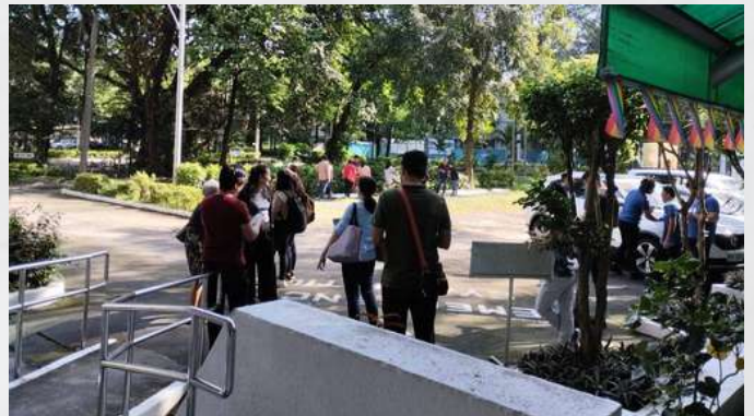
October 13 earthquake