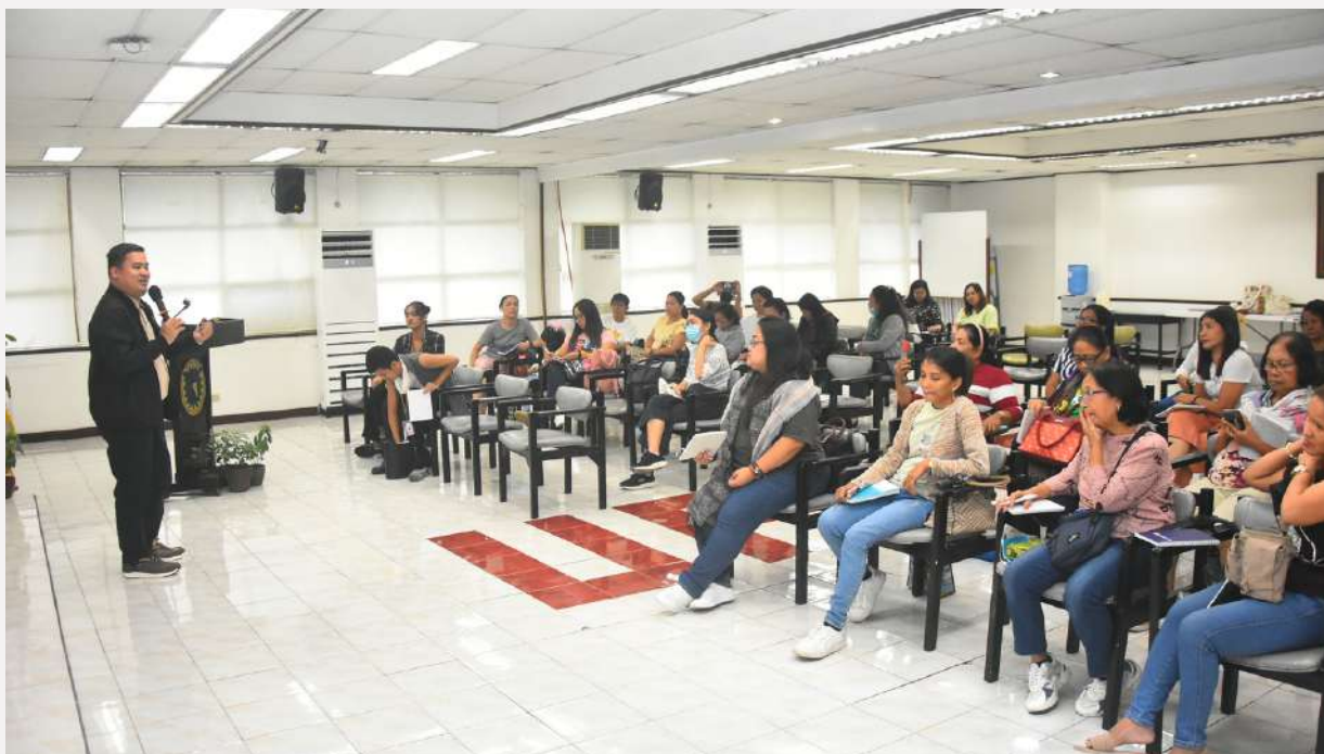
Tara Na Lecture

The University of the Philippines Institute for Small-Scale Industries (UP ISSI) recently commemorated its anniversary with a profound celebration titled "Pagsulong at Pasasalamat: Commemorating Philippine MSME Development through the Years." The event, spanning three days, was vibrant with insights, workshops, and interactions, encapsulating the journey and dedication towards fostering Micro, Small, and Medium Enterprises (MSMEs) in the Philippines.