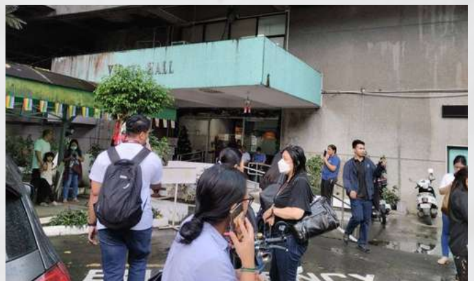
December 5 earthquake